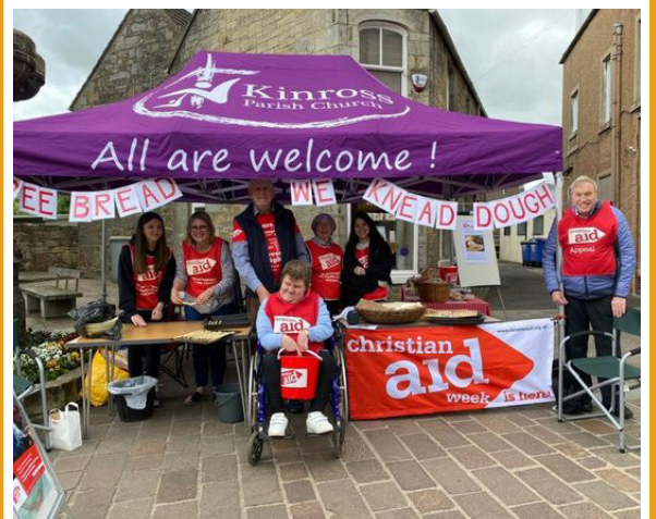
Our gazebo in use during Christian Aid Week