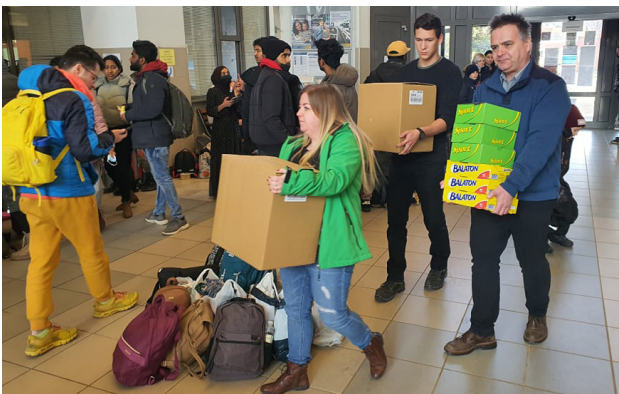
Great Church volunteers distributing aid at a border railway station

If you wish to continue to support our longer-term work in Ukraine, make a donation, marked 'Ukraine', through the church website's Giving page or bring an envelope to church.