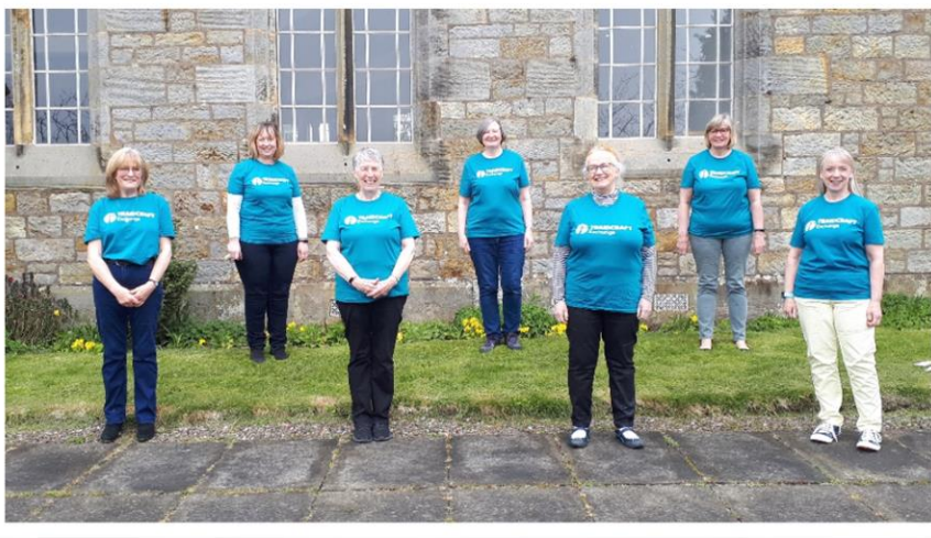
Traidcraft April Challenge Walkers

The local Christian Aid team, faced with the loss of the usual door-to-door collections during Christian Aid Week in May, appealed directly for contributions and also organised the successful Water Bucket Challenge. This involved many young folk and families and, overall, the target of £5,000 for the local